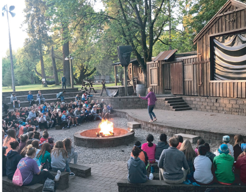
GAPS Outdoor School 2019

Albany Public Schools Foundation PO Box 1772, Albany, OR 97321 www.albanypsf.org • 541-979-2773