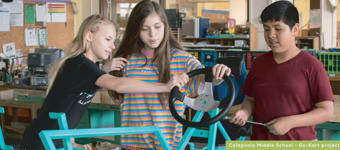
Calapooia Middle School - Go-Kart project