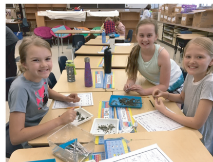
North Albany Elementary - Owl Pellets