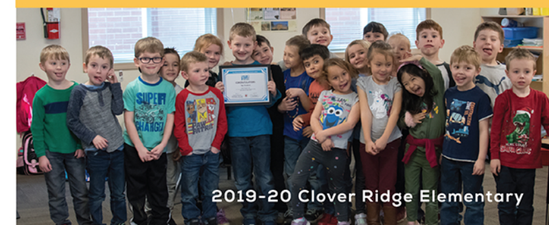
2019-20 Clover Ridge Elementary