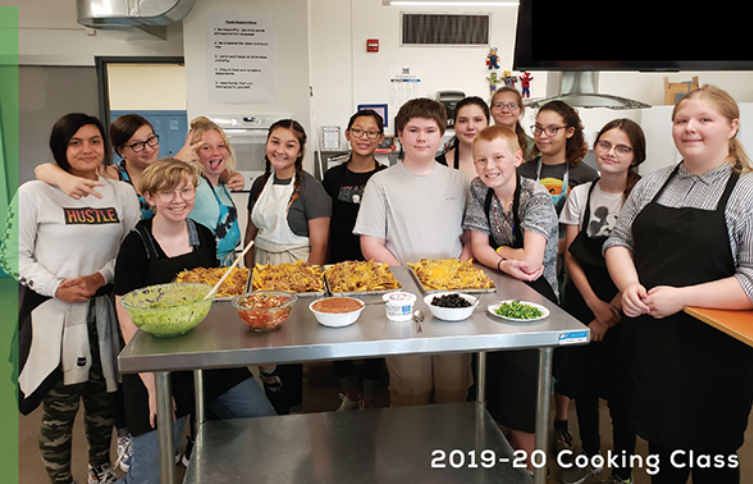
2019-20 Cooking Class

Every Student. Every Opportunity to Succeed.