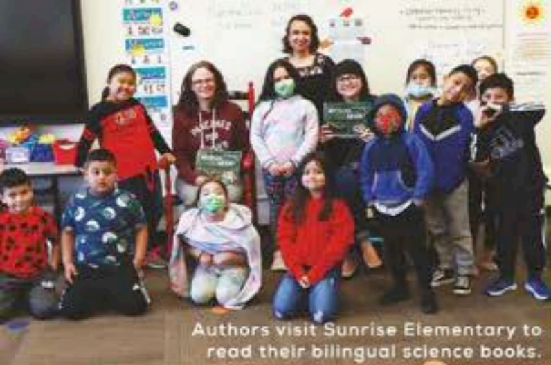
Authors visit Sunrise Elementary to read their bilingual science books.

Every Student. Every Opportunity to Succeed.