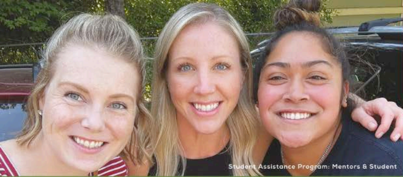
Student Assistance Program: Mentors & Student