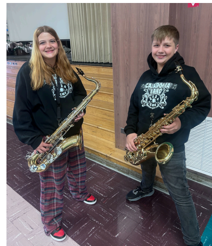
New musical instruments at Calapooia Middle School, thanks to a Classroom Grant.